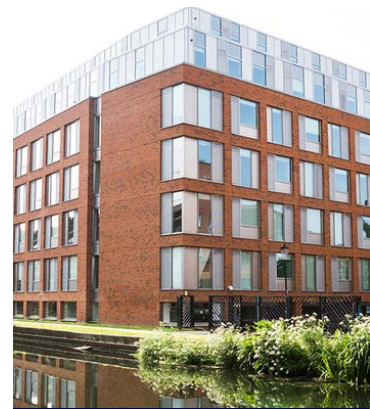
▲ Chapter Portobello, 1 Alderson St, London W10 5JY