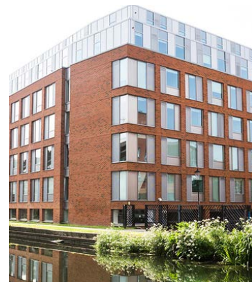
▲ Chapter Portobello, 1 Alderson St, London W10 5JY