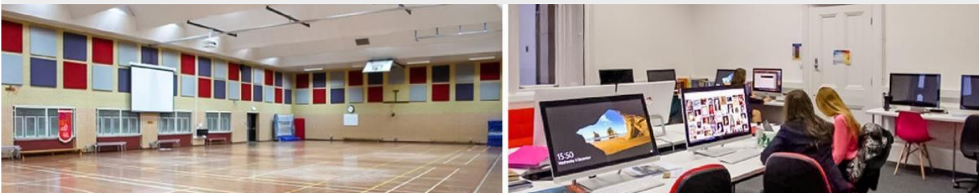
Large Sports hall and Computer room