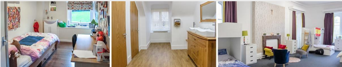
Spacious and modern Accommodation and Bathroom