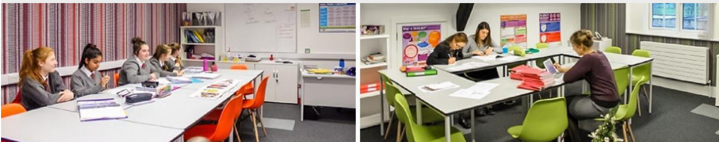
Modern Classrooms with interactive whiteboards