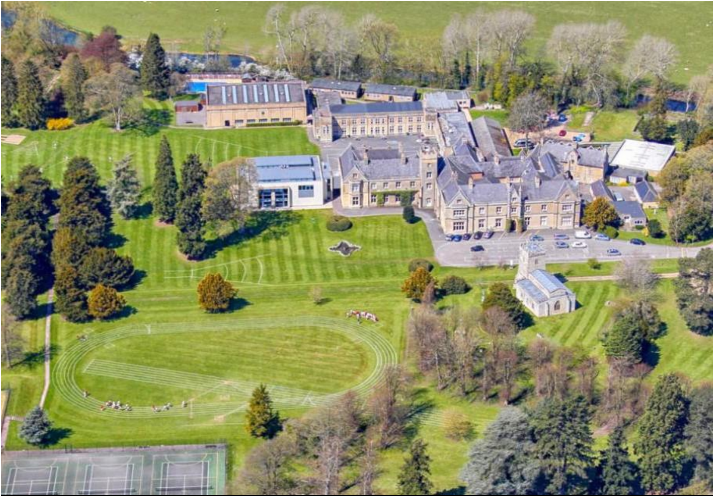
The beautiful grounds of Thornton College