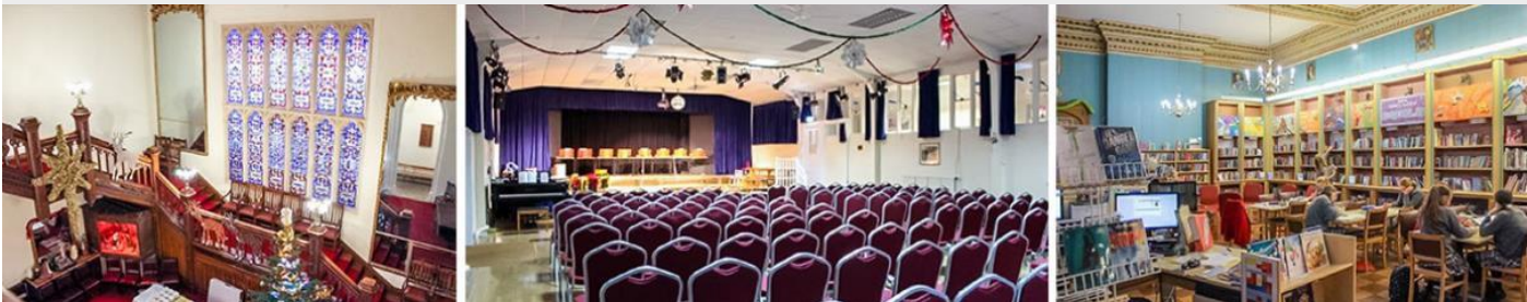
Impressive Entrance hall, Theatre and library