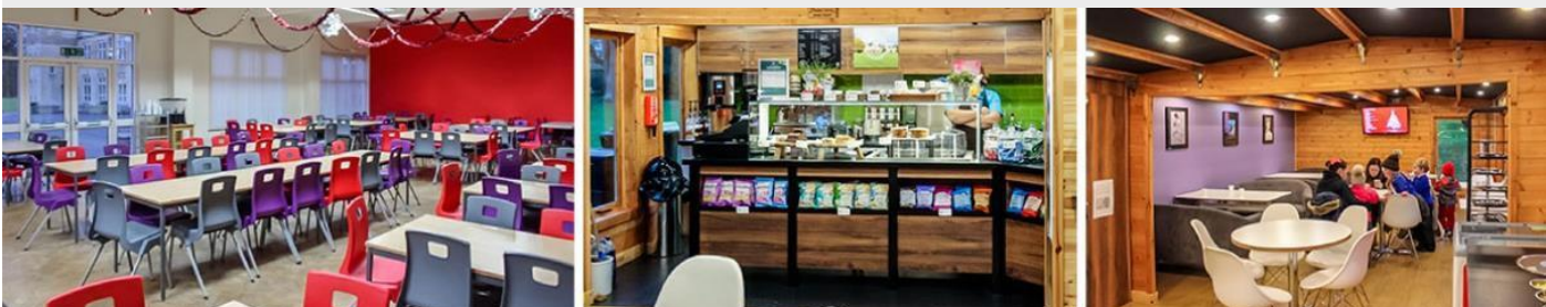
Modern Canteen and cosy Café