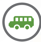
20 - 25 minutes from school on foot or by public transport