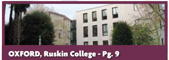
OXFORD, Ruskin College - Pg. 9