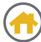
Private room with en-suite bathroom. Full board (Breakfast, Packed Lunch, Dinner)

More Info: Full board - Shared room in carefully selected homestay accommodation. Average distance from homestay is around 3km.