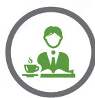
Student common room & shop