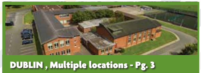
DUBLIN , Multiple locations - Pg. 3