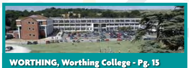
WORTHING, Worthing College - Pg. 15

Disclaimer: The contents of this brochure are intended for information only and shall not be deemed to constitute a contract between Centre of English Studies and an applicant or any third party. While every effort is made to ensure the accuracy of the information, CES reserves the right to make changes affecting policies, courses, fees, curriculum, or any other matters announced in this publication without prior notice. Students should keep informed as to the conditions and regulations applicable to their particular situation at any given time.