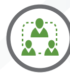
24/7 Help Line