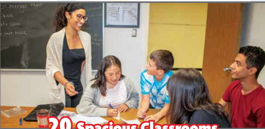
20 Spacious Classrooms