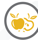
Full board homestay and residential options are available