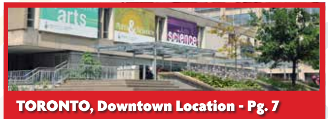
TORONTO, Downtown Location - Pg. 7