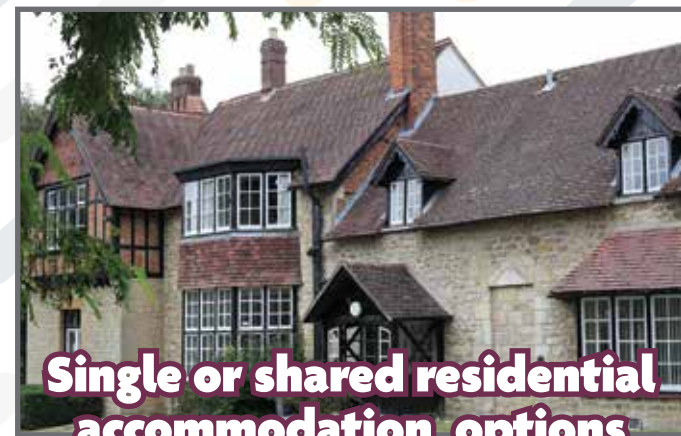
Single or shared residential accommodation options