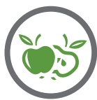
Full board accommodation: Breakfast, packed lunch, and dinner