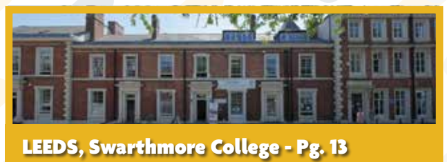
LEEDS, Swarthmore College - Pg. 13