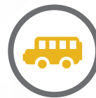
40 minutes from school by public transport