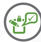
All homestays are carefully selected and visited by our accommodation team

More Info: Full board - Shared room in carefully selected homestay accommodation.