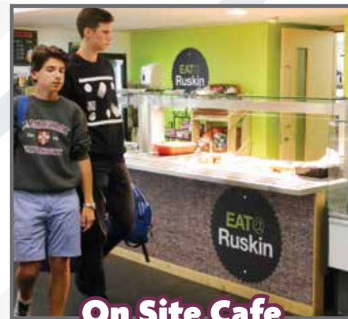
On Site Cafe