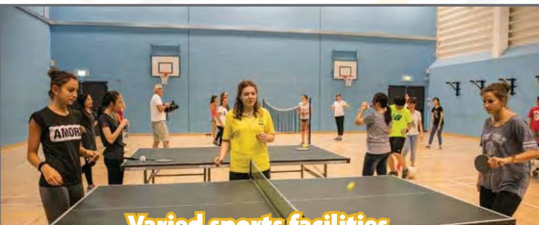
Varied sports facilities