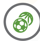
Full grass football/rugby pitches