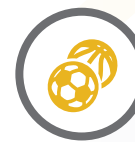
Close to university sports facilities