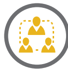
24/7 Help Line