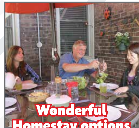
Wonderful Homestay options