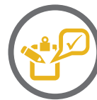
All homestays are carefully selected and visited