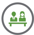
Bright & spacious classrooms