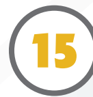
15 Minute walk from city centre

Also included: Cafeteria, dance hall, garden terrace