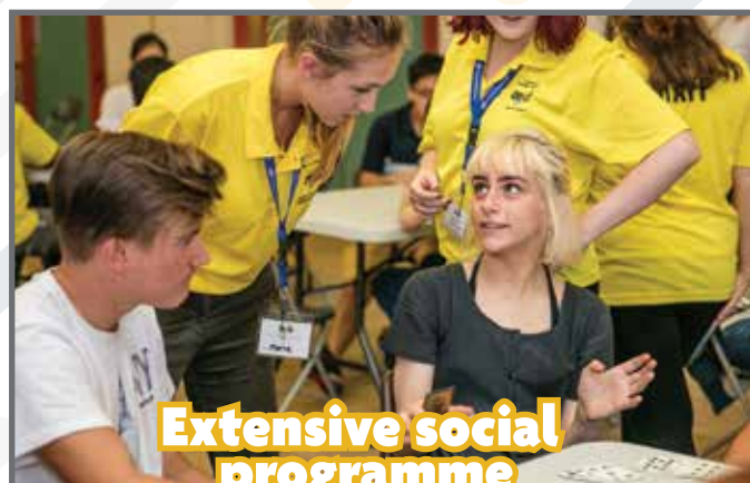
Extensive social programme