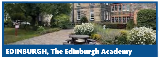
EDINBURGH, The Edinburgh Academy