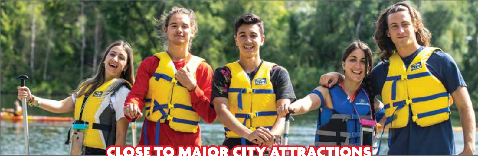
CLOSE TO MAJOR CITY ATTRACTIONS