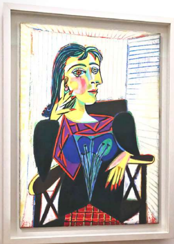
1937 Picasso Museum of Modern Art

We will learn about the origin of festivals such as the Seville Fair or Carnival, the importance of Dalí and Picasso, the musical revolution of Camarón and Paco de Lucía, the international projection of Almodóvar and Antonio Banderas.