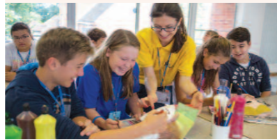
Arts and crafts