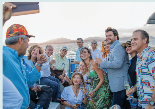
EF Santa Barbara

Enjoy the comfort, convenience and privacy of an EF-selected apartment or hotel within easy reach of your campus. We offer a great range of options and on-site amenities so you can choose whichever works best for you.