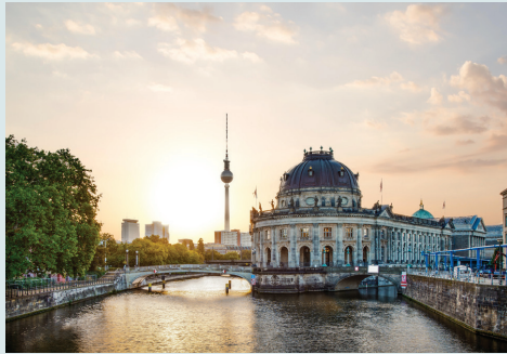
↑ Explore Berlin's picturesque and historic center

November 6 (2023), January 29, March 4, April 15 & May 13 (2024)