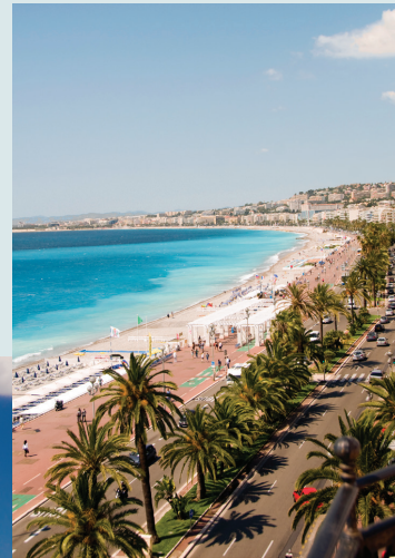
↑ Lounge by the beach while discovering Nice