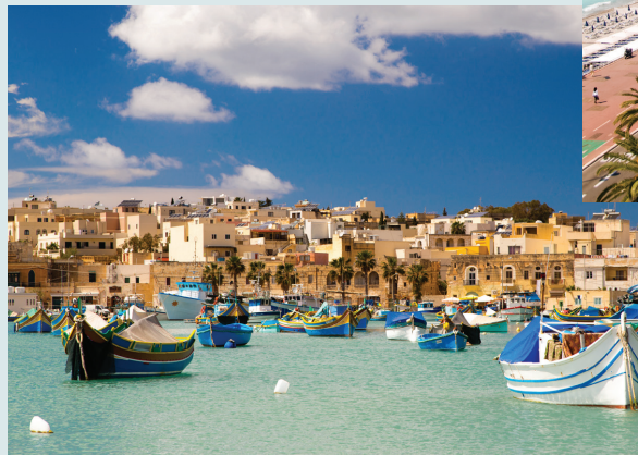
→ Soak in the sun at Malta St. Julian's