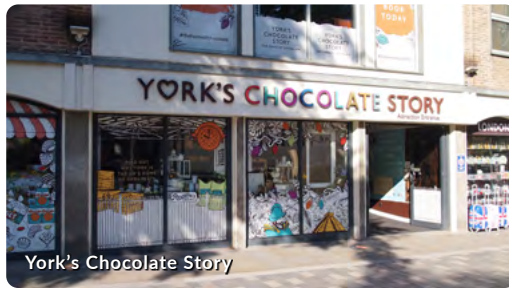
York's Chocolate Story