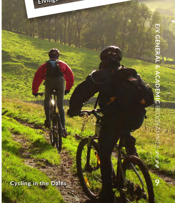
Cycling in the Dales

Just two hours from York, it's easy to visit London for the day and see some of the UK's most famous landmarks such as Big Ben, Buckingham Palace, Covent Garden with shopping in Oxford Street and theatre in the West End.