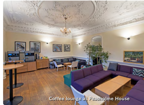
Coffee lounge at Peasholme House