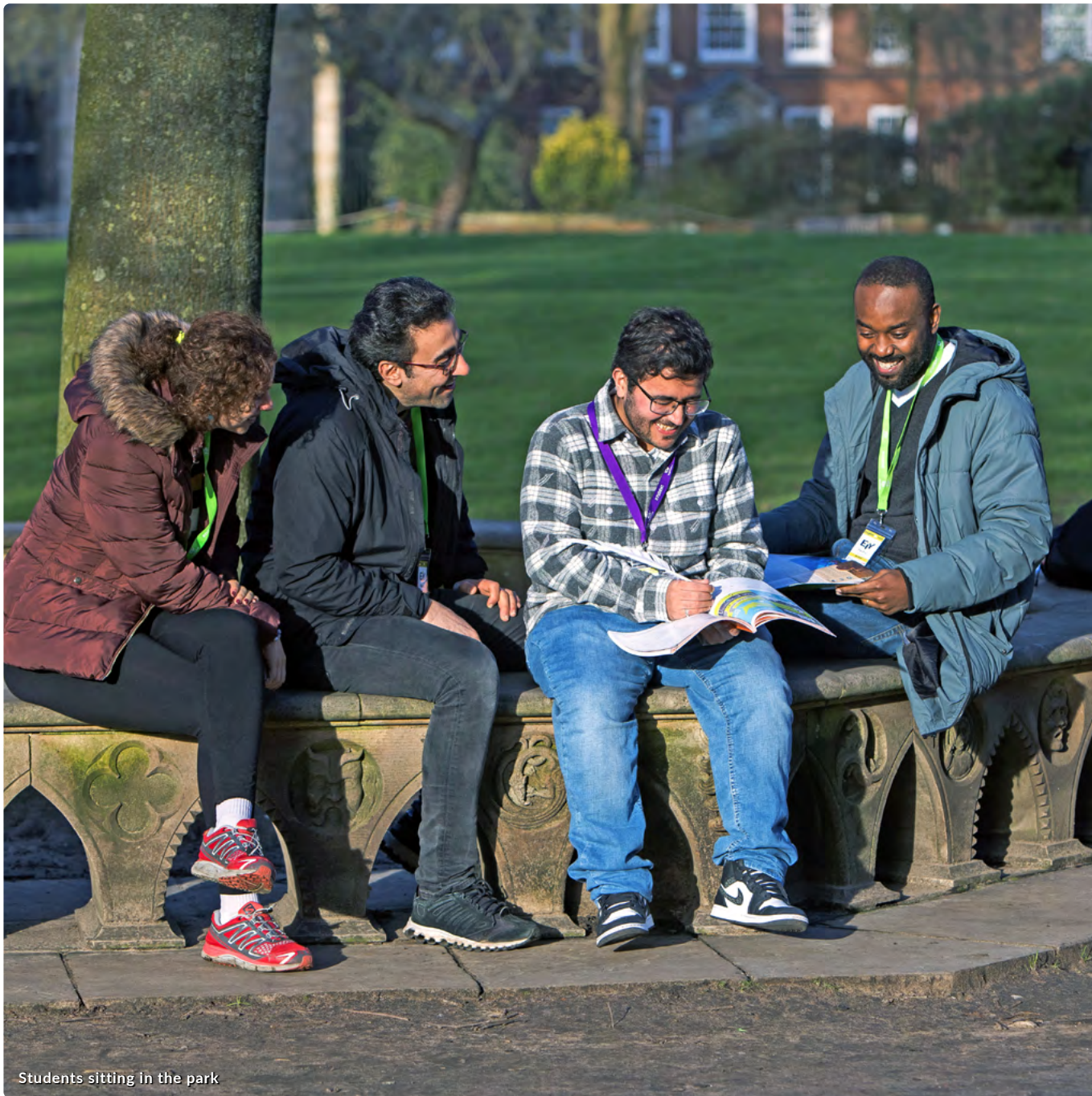
Students sitting in the park