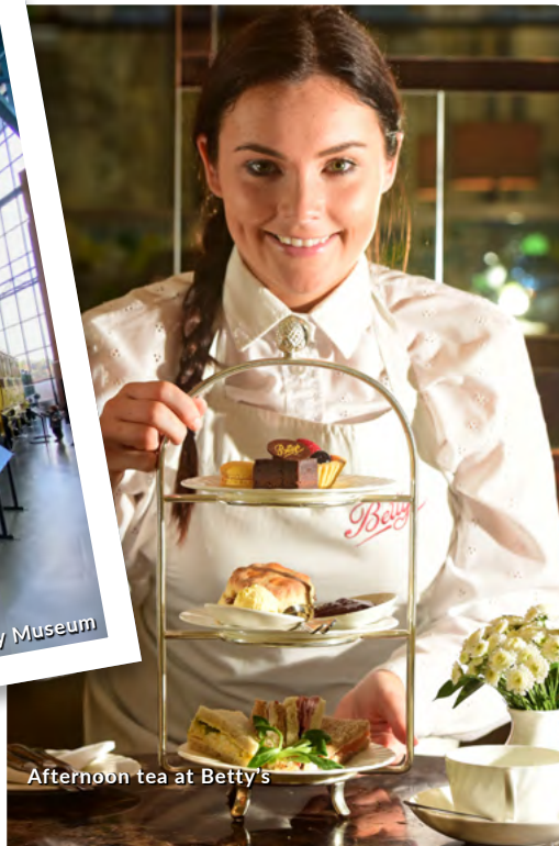
Afternoon tea at Betty's