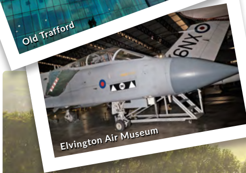
Elvington Air Museum