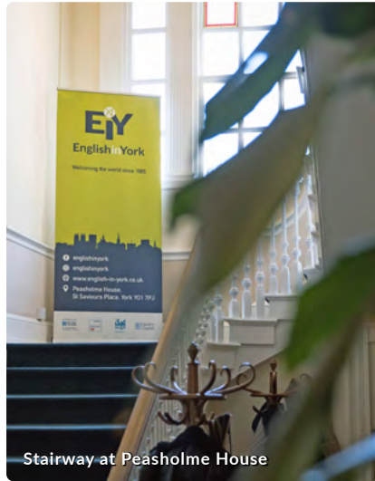
Stairway at Peasholme House