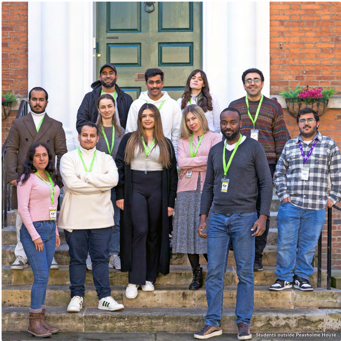
Students outside Peasholme House