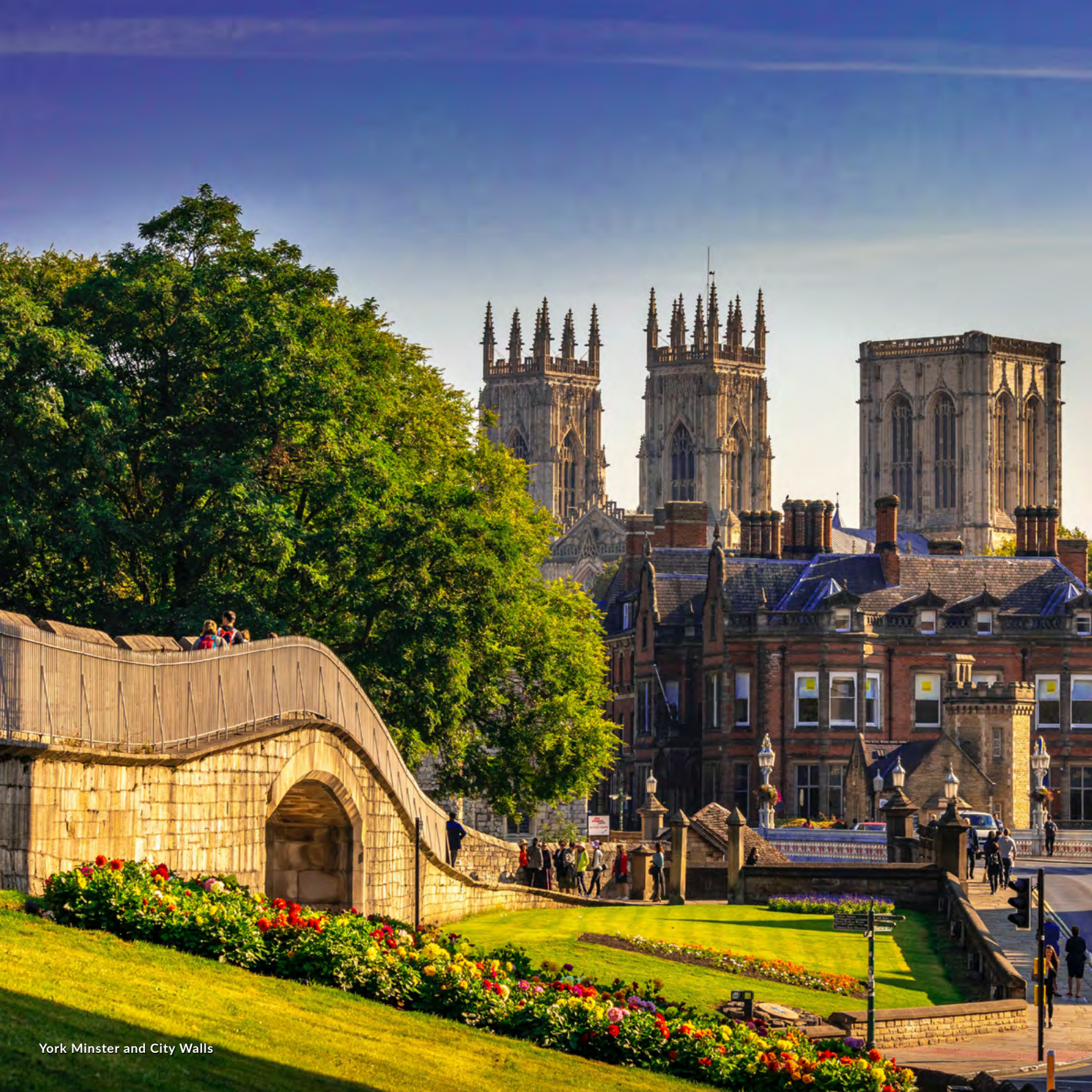
York Minster and City Walls