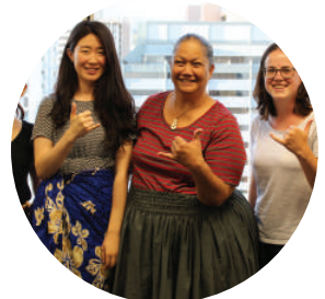
WEEKLY CULTURAL ACTIVITIES