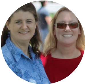
HIGHLY QUALIFIED TEACHERS

Learn English in Honolulu with private language lessons, and enjoy cultural activities that allow you to explore the beauty of Hawaii.