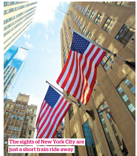
The sights of New York City are just a short train ride away