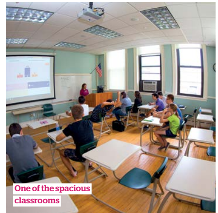
One of the spacious classrooms