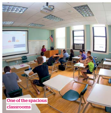
One of the spacious classrooms