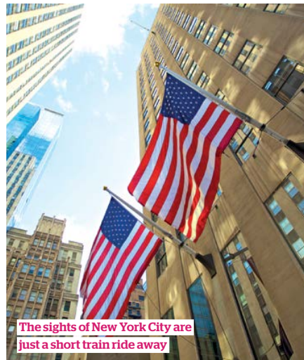
The sights of New York City are just a short train ride away