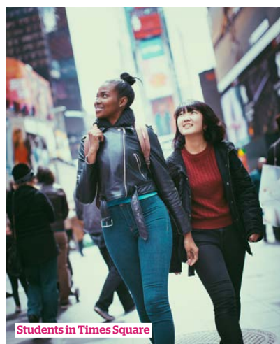
Students in Times Square