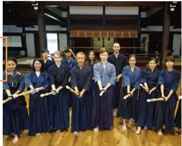
Tuesday, August 4th Kendo Experience