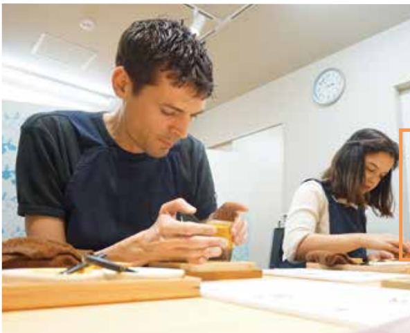
Thursday, August 6th Kyo-Karakami Postcards Making Experience