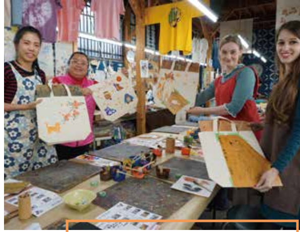
Tuesday, July 28th Japanese Dyeing Experience