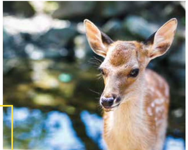
Saturday, August 22nd Day Trip to Nara, Japan's Ancient Capital – Let's Meet Some Deer <2,360 JPY>