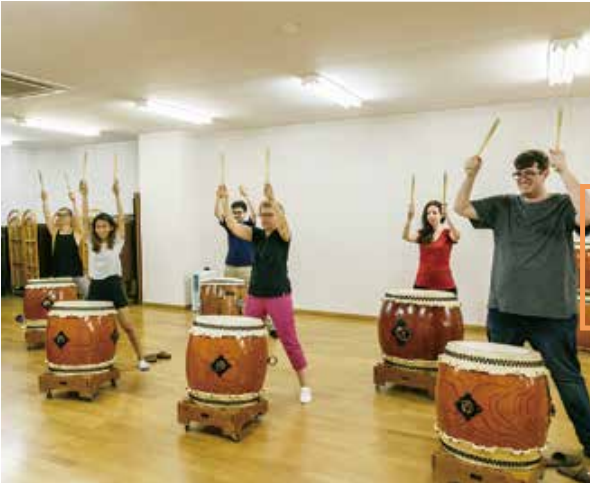
Friday, July 31st Japanese Taiko Drumming Experience