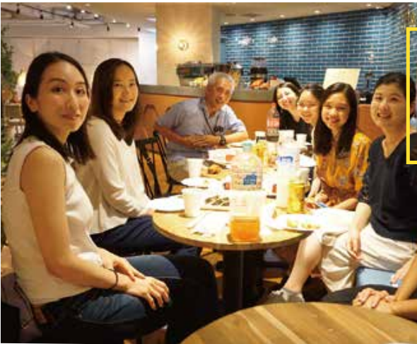
Friday, August 21st Summer Course Graduation Party <2,000 JPY>