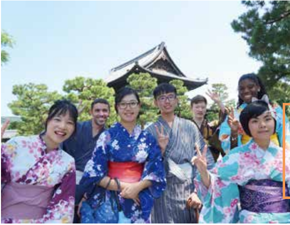
Friday, August 14th Let's Wear Yukata and Watch the Gozan Okuribi (Daimonji)