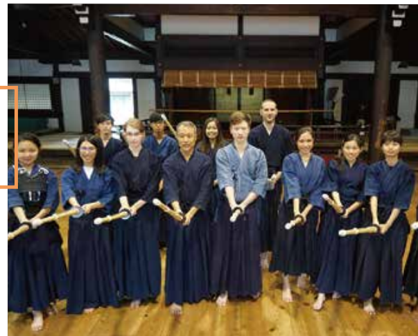
Tuesday, August 4th Kendo Experience