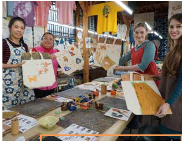
Tuesday, July 28th Japanese Dyeing Experience