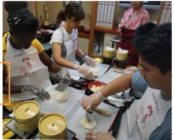
Tuesday, August 18th Japanese Sweet Making Experience