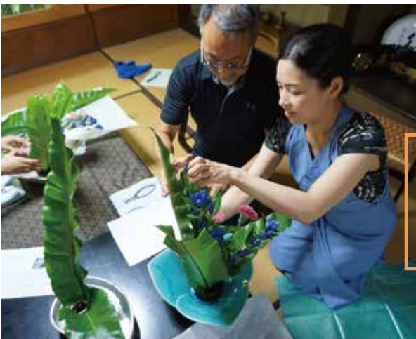
Thursday, August 20th Japanese Flower Arranging (Ikebana) Experience