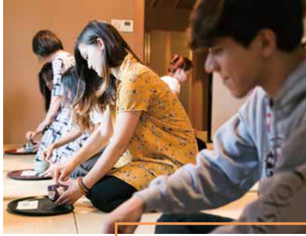
Tuesday, August 11th Tea Ceremony Experience