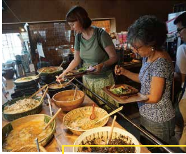
Monday, August 17th Buffet Lunch - All you can eat Kyoto cuisine <900 JPY>