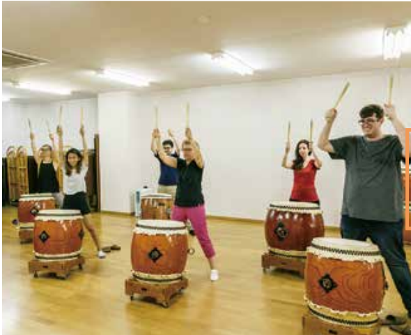
Friday, July 31st Japanese Taiko Drumming Experience