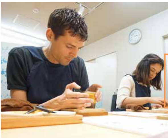
Thursday, August 6th Kyo-Karakami Postcards Making Experience