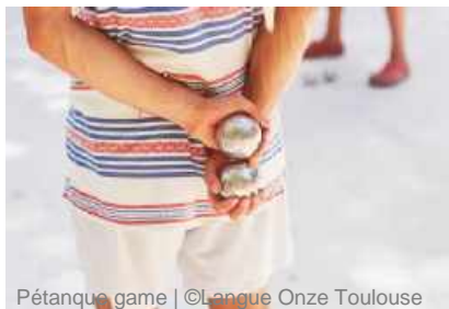
Pétanque game