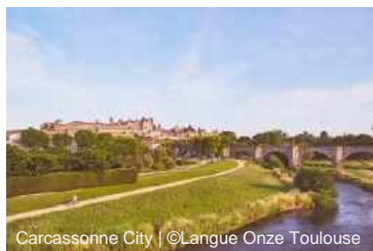
Carcassonne City