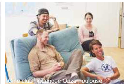
Cine club

Student receive the schedule of their first day with the Cultural Programme one week his/her course starting date. Taking part to these activities is an exceptional way to discover how the south west cultural heritage is rich and beautiful!