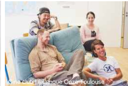
Cine club

Student receive the schedule of their first day with the Cultural Programme one week his/her course starting date. Taking part to these activities is an exceptional way to discover how the south west cultural heritage is rich and beautiful!