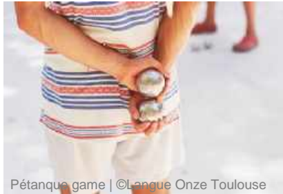
Pétanque game