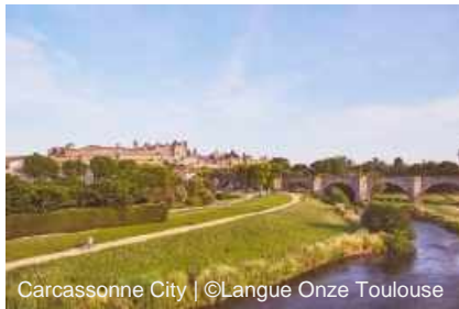
Carcassonne City