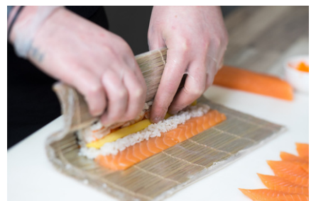
お寿司作り体験 Sushi Making