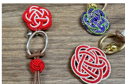
水引ワークショップ Mizuhiki Making