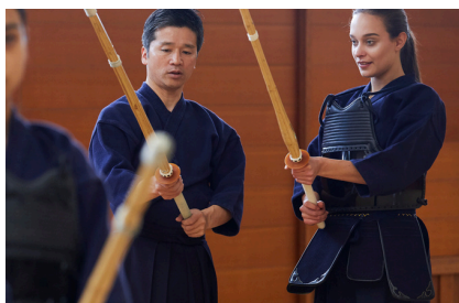
剣道 Kendo Experience