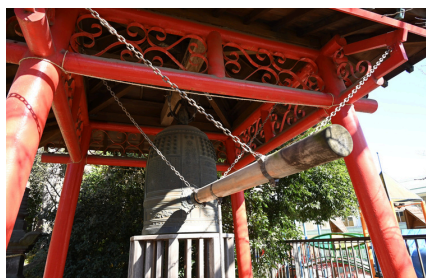
初詣 New Year Festival