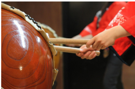
和太鼓 Wadaiko Drum Lesson