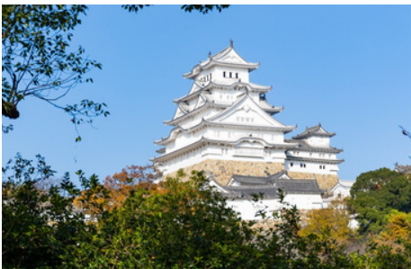
姫路城 World Heritage Site Tour