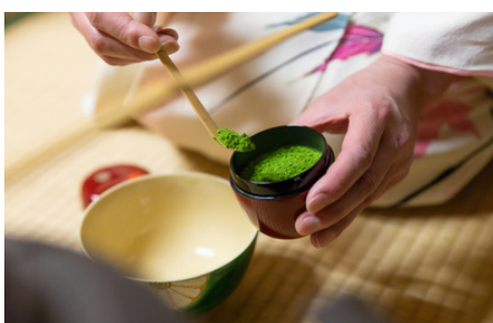
茶道 Tea Ceremony