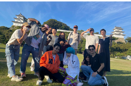
国際交流 Social Events with Locals