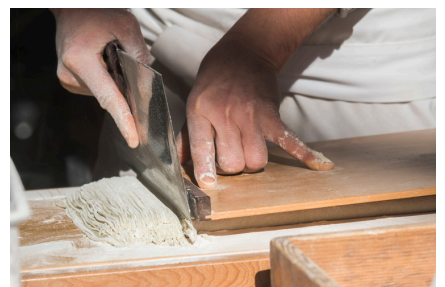
蕎麦作り Soba Making