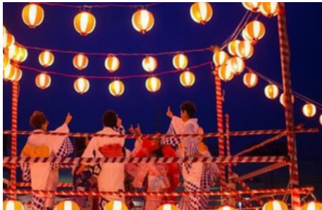
夏祭り Summer Festival

**Minor changes in activities might happen