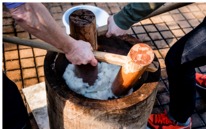
餅つき Mochi Making

**Minor changes in activities might happen