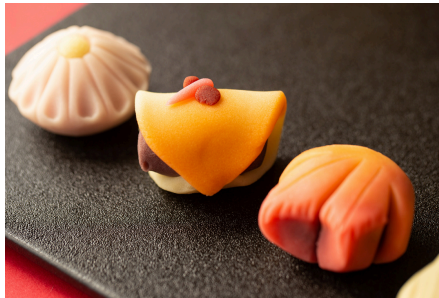
和菓子作り体験 Japanese Sweets Making