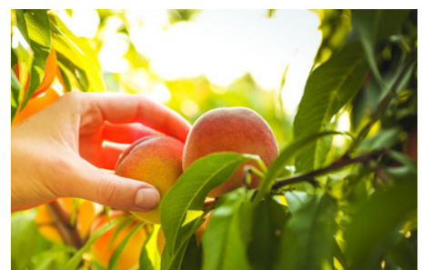
桃狩り Fruit Picking