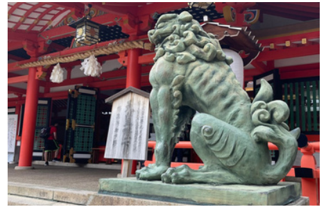
神社巡り Japanese Shrine Tour