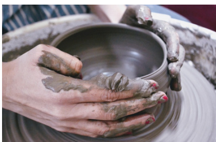
陶芸 Pottery Workshop