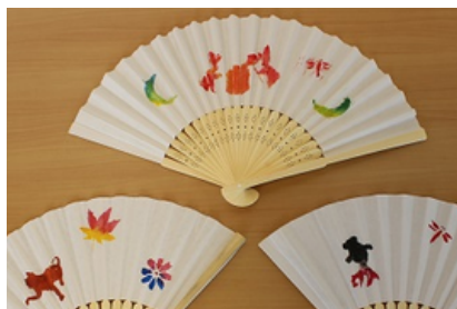
扇子作り Fan Painting Workshop