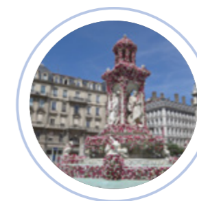
Lyon, the world capital of gastronomy

Lyon is designated as a UNESCO World Heritage Site: museums, festivals, historical districts and monuments to explore