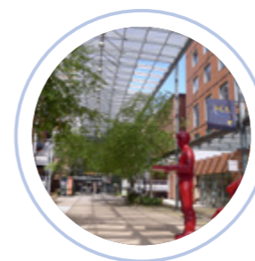
Lyon city of culture

Lyon Bleu International is an ambassador for Only Lyon/Tourist Office