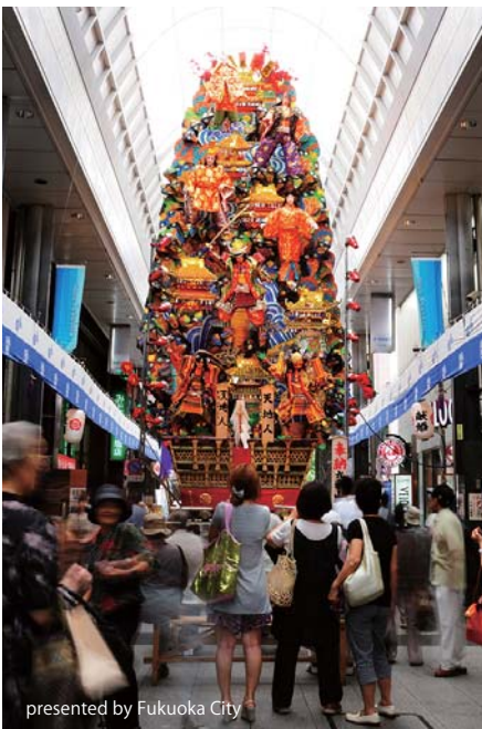
presented by Fukuoka City