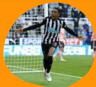
St James' Park Home of NUFC