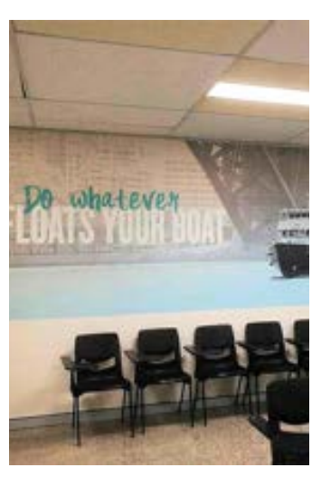
Holmes Colleges Sydney Pty Ltd. T/A Oxford House College | CRICOS Provider Code: 00040C