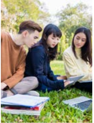
Holmes Colleges Queensland Pty Ltd. T/A Oxford House College | CRICOS Provider Code: 01647G