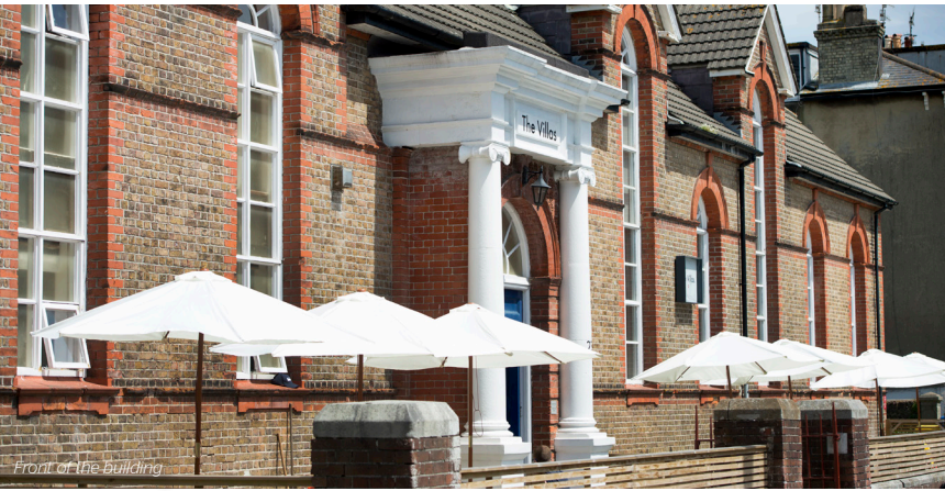
Front of the building

**Not included for lessons only programmes