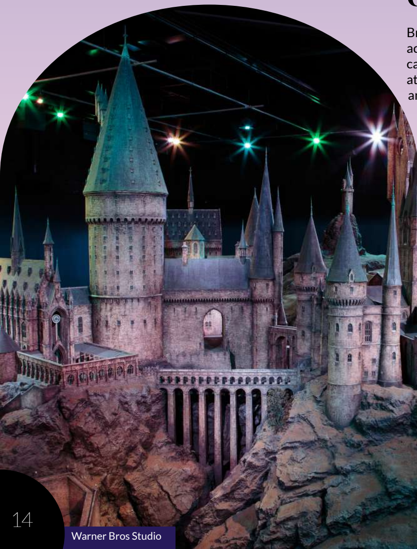
Warner Bros Studio