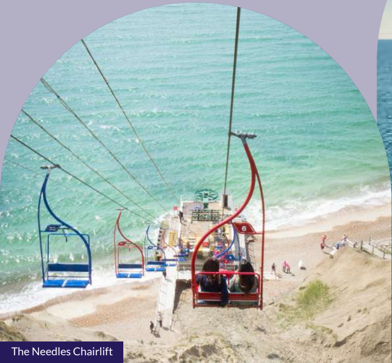
The Needles Chairlift