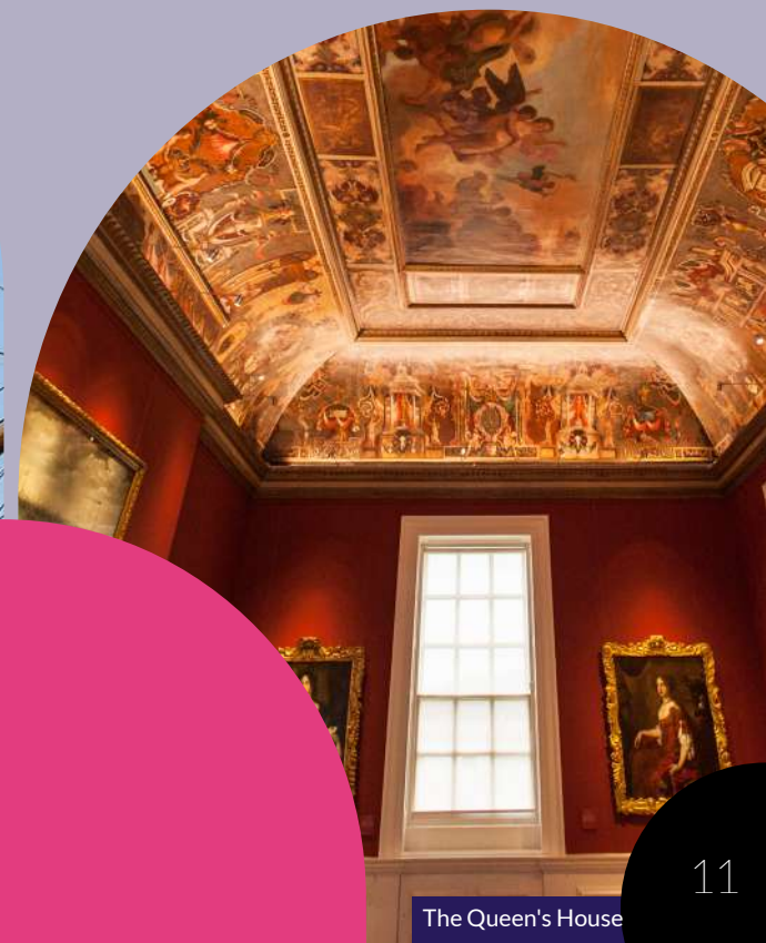
The Queen's House