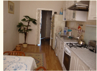
Our shared flat