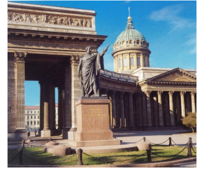
The Kazan Cathedral

Learn Russian at ProBa - near Nevsky Prospekt - it's meant to be in the focus of cultural life, business activities and public amusements of St. Petersburg.