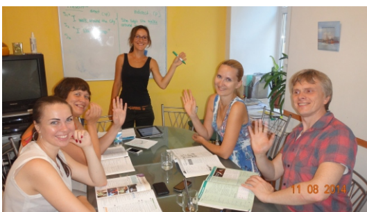
We offer courses in small group

During the course we offer rich cultural program including excursions and tours to other Russian cities. Some excursions are, so called, study excursions, when a guide uses “adapted” Russian to help the students not only get some extra vocabulary knowledge, but also to practice there conversational skills. These excursions are arranged in the way that even a beginner will not waste the time but enlarge his Russian vocabulary. Study excursions are the part of the educational program and usually are devoted to different topics covered in classrooms.