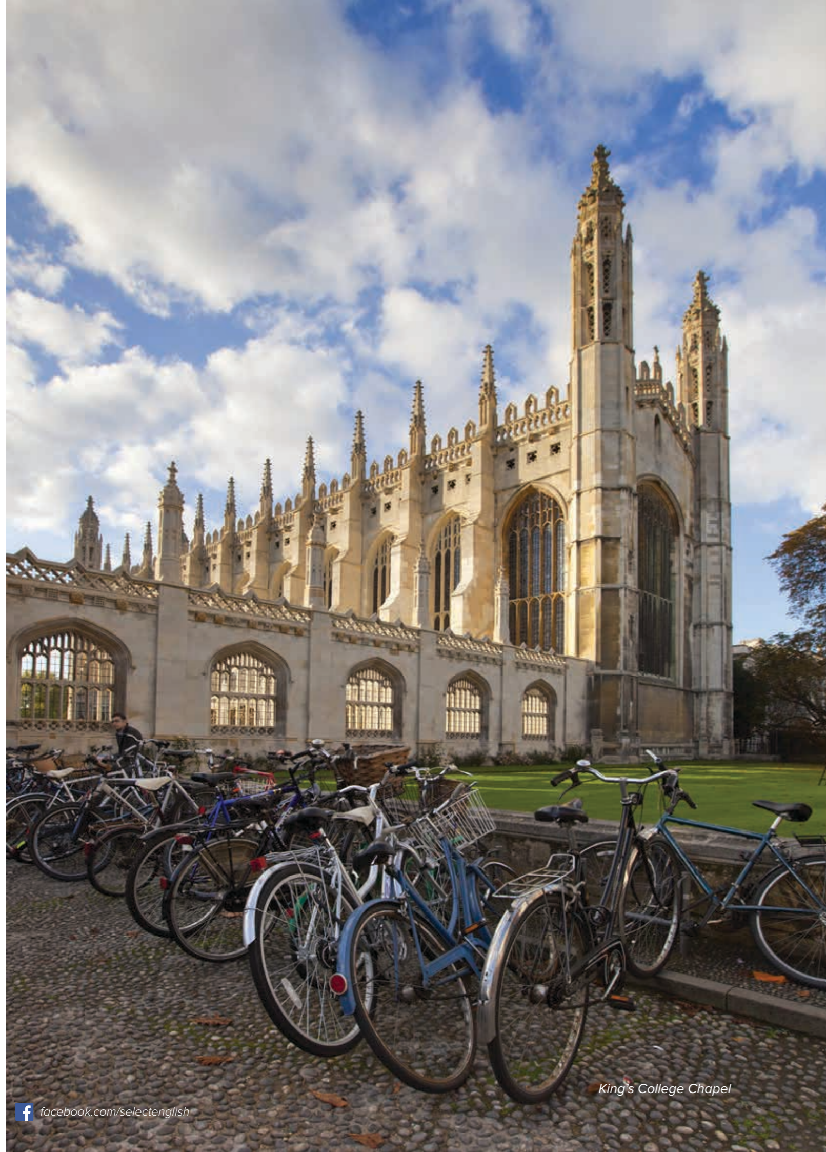
King's College Chapel

Select English was established in Cambridge in 1991. We are committed to providing high quality, personalised teaching that helps all our students reach their learning goals. As a small, family-run school, we treat all our students as individuals and offer a friendly, stimulating, supportive and inclusive environment to help you at every stage of your learning.