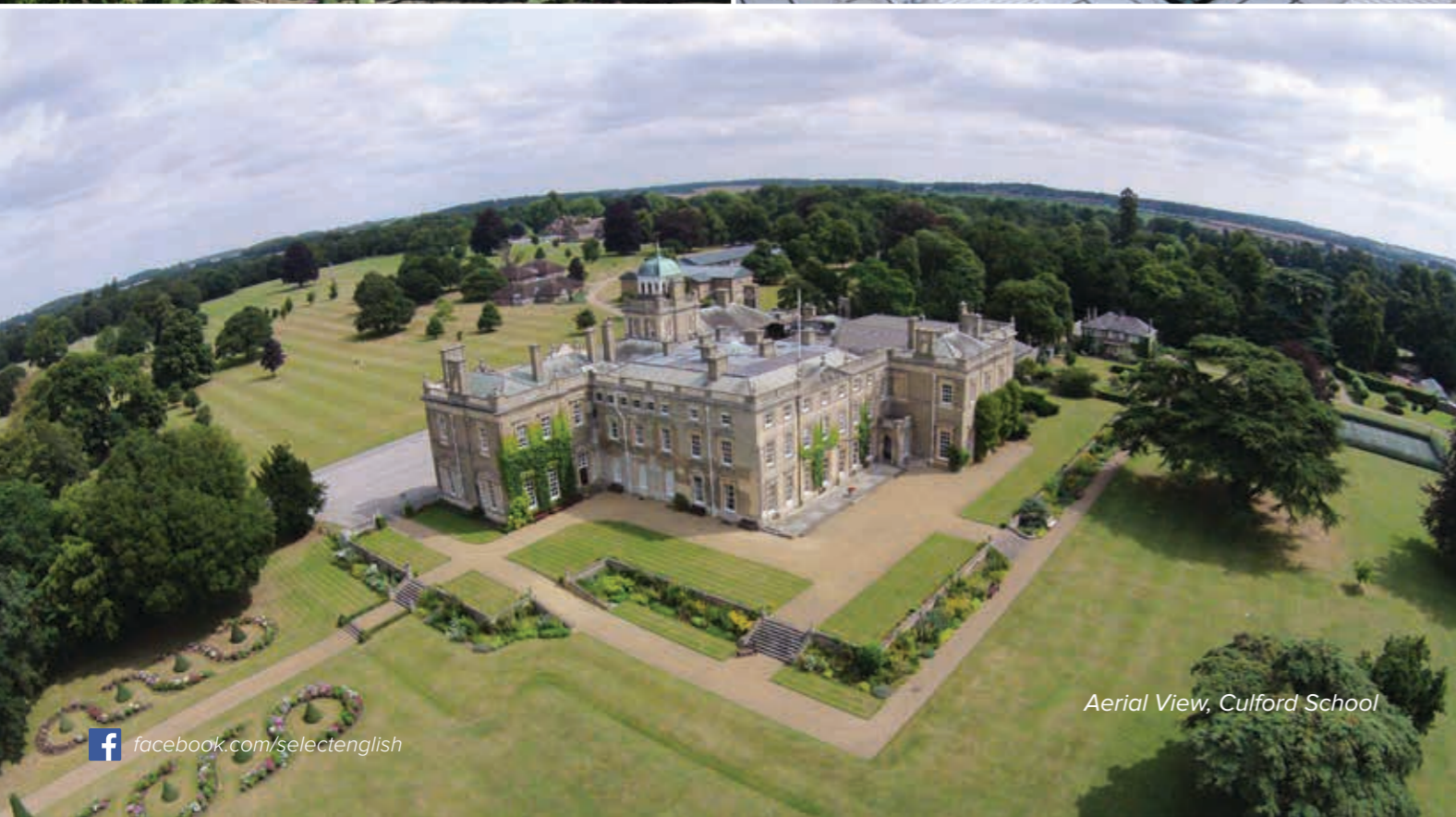
Aerial View, Culford School