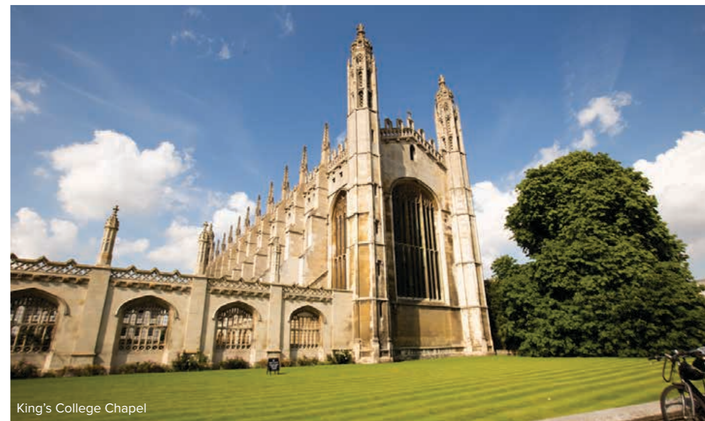
King's College Chapel