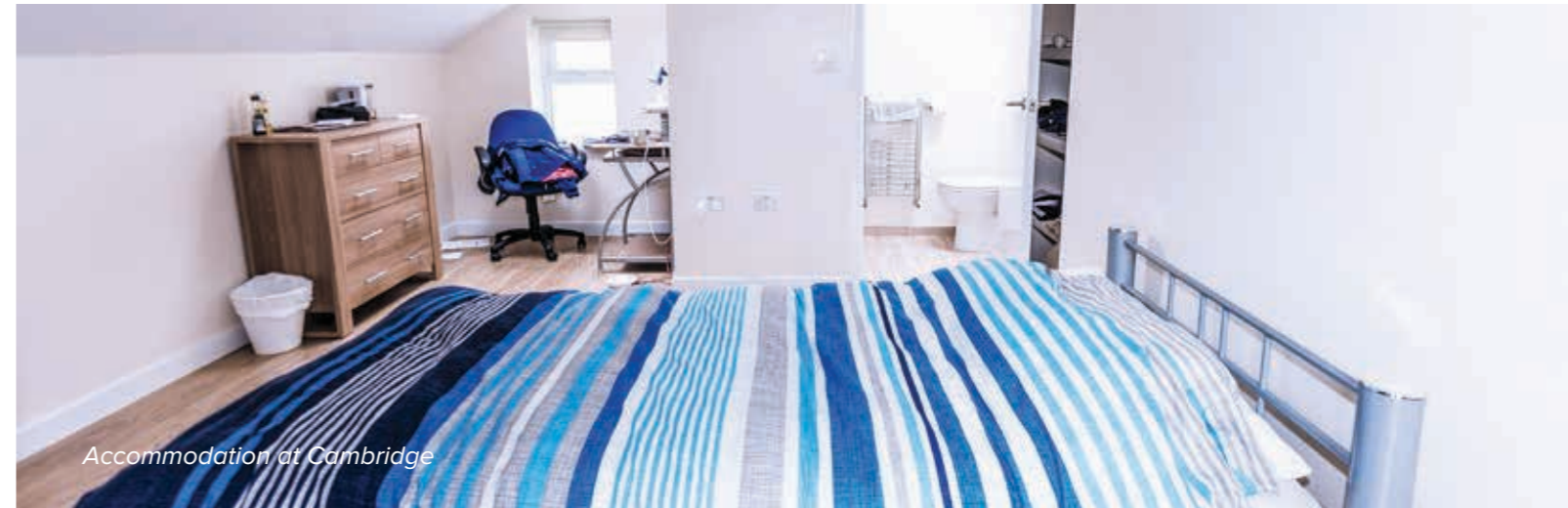
Accommodation at Cambridge