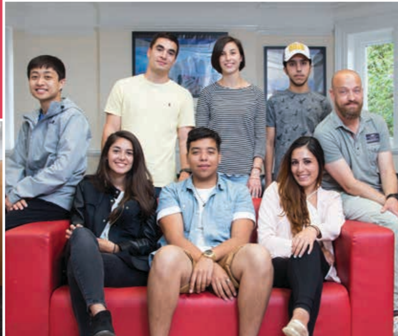
Cambridge University View