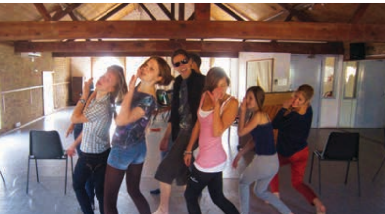
King's College, Cambridge University