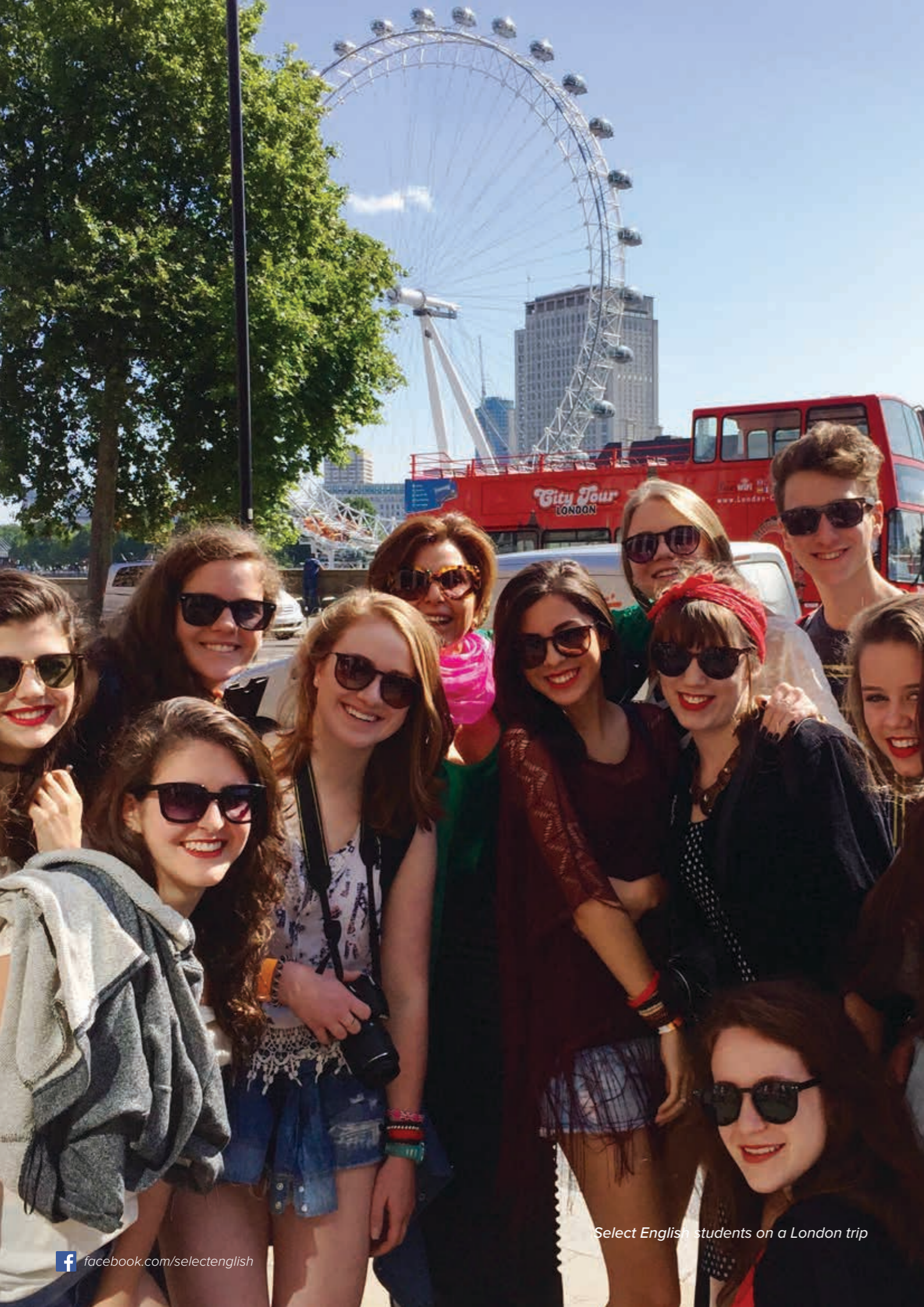
Select English students on a London trip