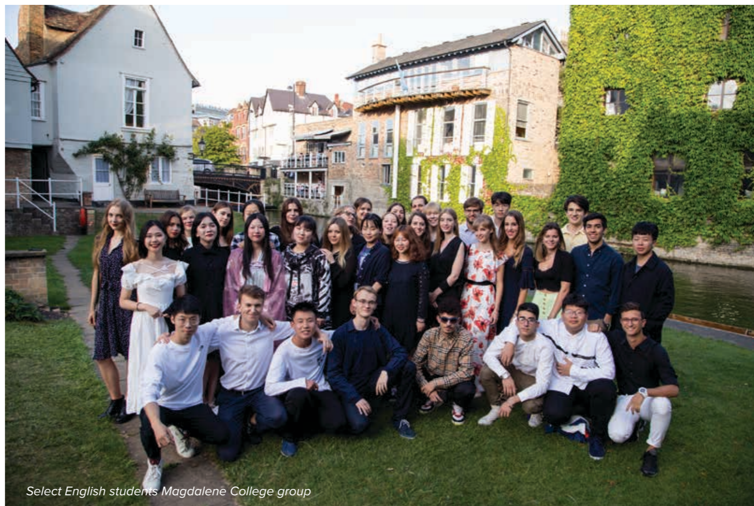
Select English students Magdalene College group

The expertise of our academic teachers and the superb facilities on our campus allow us to offer programmes combining English classes with lessons and practical sessions focusing on areas such as art, science and business. We also offer practical