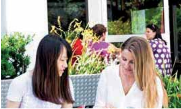
With a variety of courses available, every student has the opportunity to invest in a German course that will help them meet their language goals.

6 weeks from 1.930,- EUR Incl. course & accommodation