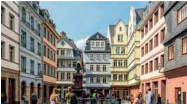
The impressive Old Town is just a short walk from Sprachcaffe across the famous "Eiserner Steg" bridge, which takes students right into the pulsating city centre of Frankfurt.