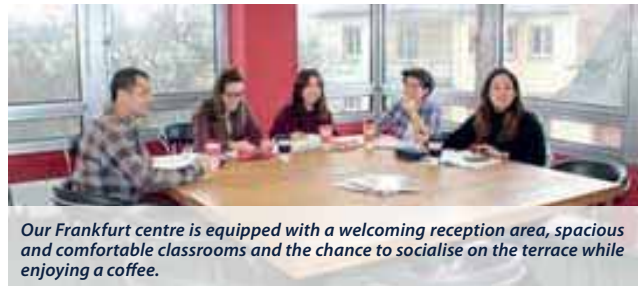
Our Frankfurt centre is equipped with a welcoming reception area, spacious and comfortable classrooms and the chance to socialise on the terrace while enjoying a coffee.