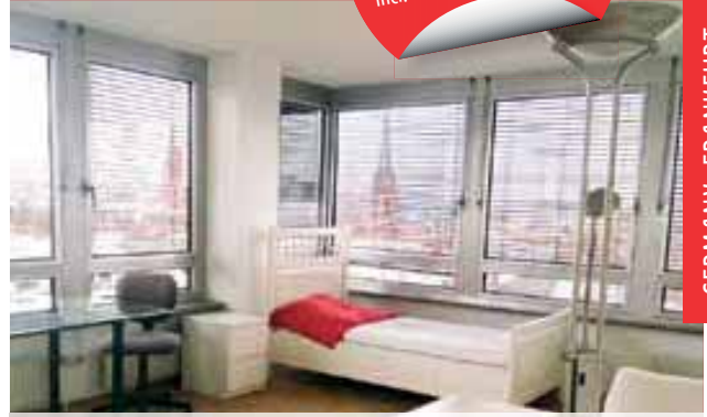
In Frankfurt you can choose between three comfortable accommodation options which are all conveniently located and carefully selected by our staff.