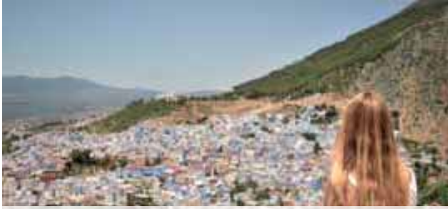
Don't miss the Mausoleum of Mohammed V! Here, the former king of Morocco rests with his two sons at either side.

6 weeks from 1.830,- EUR Incl. course & accommodation