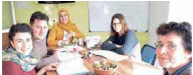
Classrooms are well equipped and teachers carefully selected and highly qualified, guaranteeing you an ideal language learning experience and the perfect place to learn either Arabic or French.