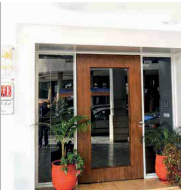
Our school is an oasis within Rabat. Located in the very heart of the city, it is a 5 minute walk from the famous Avenue Mohammed V and just a 10 minute walk from the Medina.

The Kingdom of Morocco nestles between the Mediterranean, the Atlantic & the endlessness of the Sahara Desert.