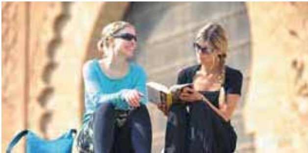
Medina is one of the most famous Oriental historical centres with numerous magical tales spun from the past. You can reach the school on foot within just a couple of minutes.