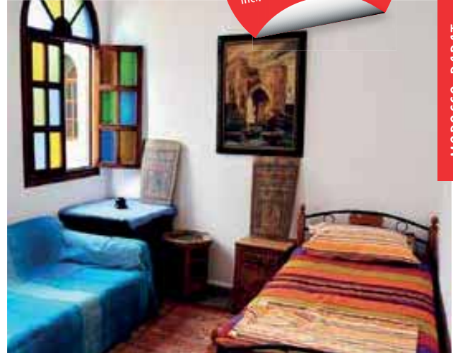
There are 3 different types of accommodation: guesthouse, hotel and host family. Breakfast is included in all three, while host families also provide dinner.