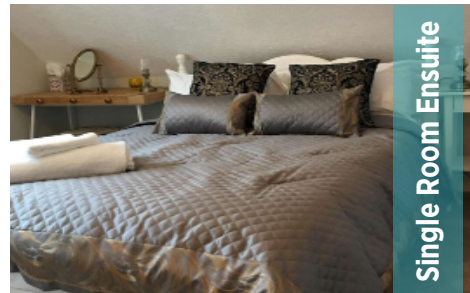
Single Room Ensuite