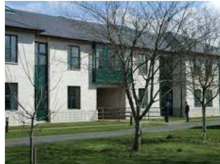
King's Hospital accommodation