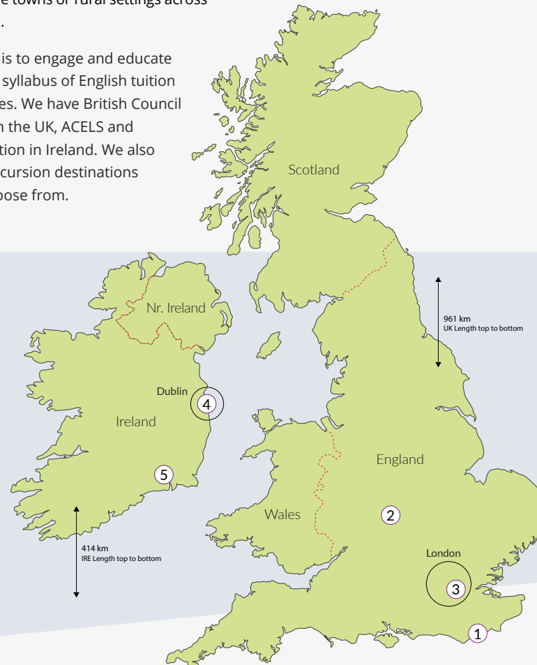
An action-packed, unforgettable summer experience