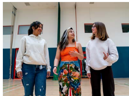
On sight Sports hall