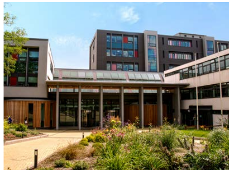
Leamington Spa exterior