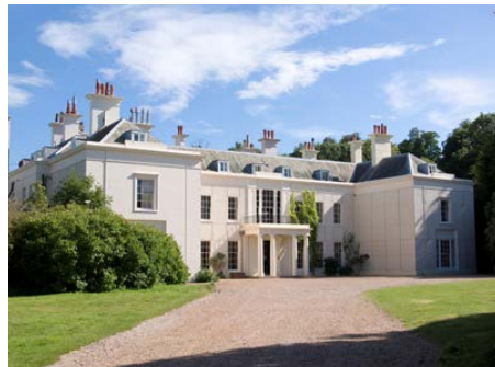
Compton Place exterior