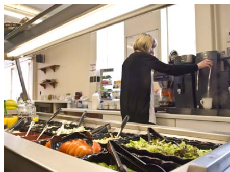
On sight canteen