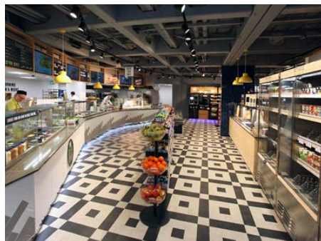
On sight canteen