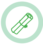
Certificate at the end of the programme