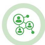
Exciting social programme